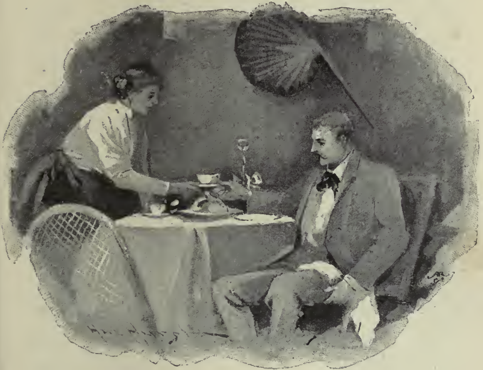
I LOOKED CAREFULLY AT THE CUP